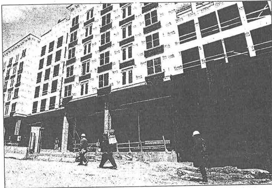
The North Hills project could see $1 billion in development, including 1,800 residential units, 4,500 feet of retail space and 800 hotel rooms. A Hyatt Summerfield Suites was scheduled for construction this year but has been delayed.

RALEIGH COUNCILWOMAN WHOSE DISTRICT INCLUDES NORTH HILLS